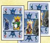
The King has had enough!

If you are unable to play a card on your turn (for example: because all players have a color in front of them, and you have no cards that match those colors), you must instead take all the face-up cards and place them in your face-down stack.